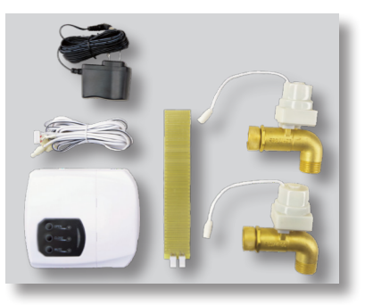
LeakSmart Washing Machine Appliance Kit